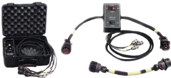
Large selection of aircraft specific interface cables available

Each aircraft platform requires a unique interface to access the FQIS. The complexity of the fuel system determines the capability of the interface to allow for complete testing of the fuel quantity system. Contact VIAVI for the proper interface for your aircraft.